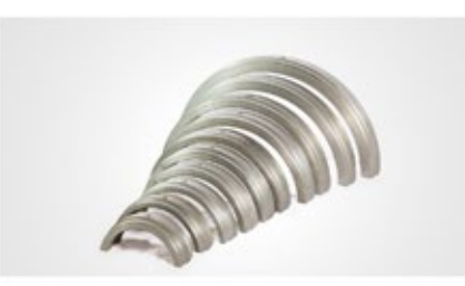
RIYANG aluminum reducing inserts