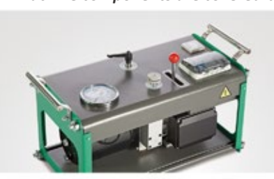
Hydraulic unit with detachable frame