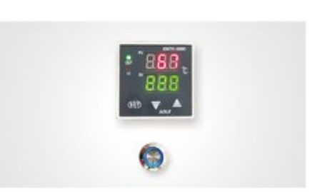
Centralized temperature controller with On/Off button