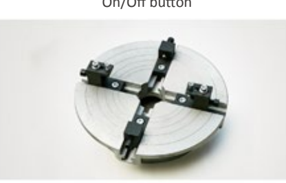
Aluminum stub end device