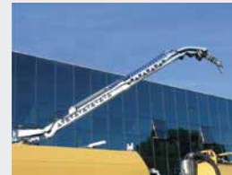
Telescopic suction boom