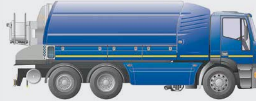
Fresh water in side-mounted water tanks in polyethylene or stainless steel