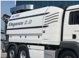
Attractively designed side panels with side-mounted water tanks