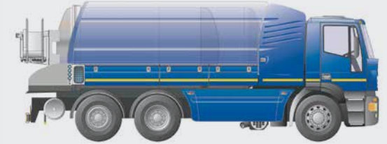
Combination of fresh water tanks at front and sides