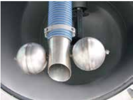
Sludge tank dewatering