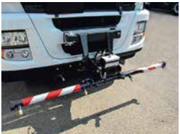
Street washing bar