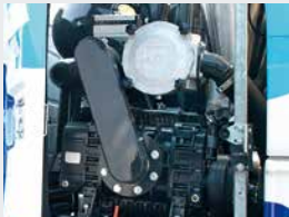
Rotary piston or rotary plunger vacuum pumps