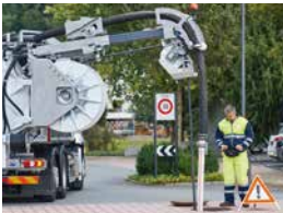
Combined suction/jetting boom