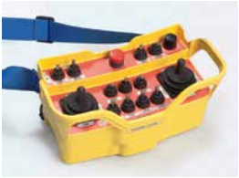
Radio remote control