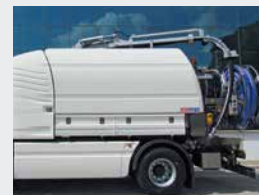
Telescopic suction boom 360°