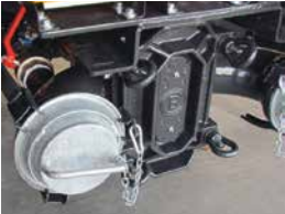
Additional feed pump