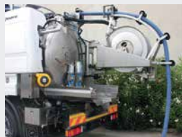
Standard suction boom