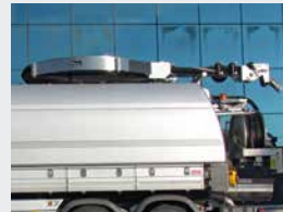
Spiral suction boom