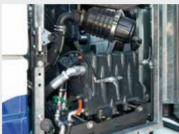
Triplex high-pressure pumps