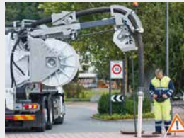
Combined suction/jetting boom