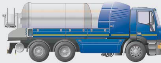
Fresh water in front section of the tank, with permanent separation from sludge tank

The Elegance line offers different versions for the ideal combination of fresh water and sludge tank, while simultaneously ensuring optimal axle load distribution and maximum payload.