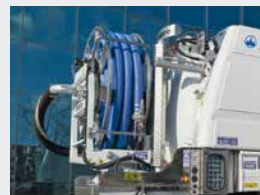
Suction hose reel