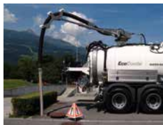
Suction boom KSR10