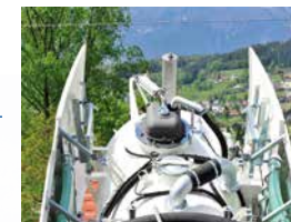
Suction/pressure changeover head