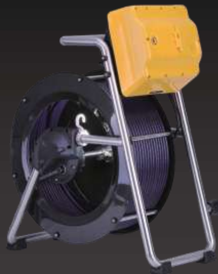
D18-MX D26-MX Cameras